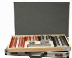
Trial Lens Set

For more high-quality diagnostic equipment & accessories, visit s4optik.com